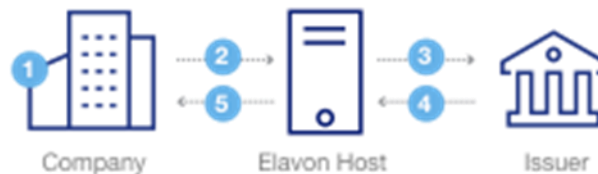
Figure 2-1. Authorization Process

The following diagram describes the electronic authorization process: